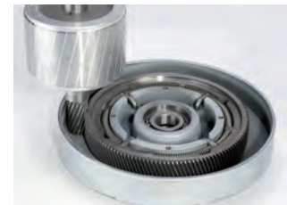
Metal Gear drive